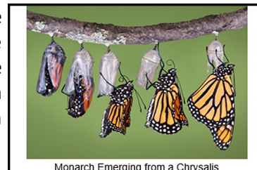
Monarch Emerging from a Chrysalis

During this time the chrysalis will go through many color changes, and when the butterfly is ready it will rip through a seam at the bottom of the chrysalis. The Monarch's wings will be small and wet when he emerges from the chrysalis, the butterfly will hang off the chrysalis and pump fluid into its wings and let them dry for a couple hours before being able to fly. Now the Monarch Butterfly is ready to load up on nectar so that this new generation may begin their leg of the journey.