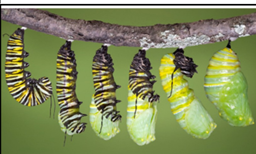
Monarch Caterpillar Becoming a Chrysalis

http://ovlc.org/wp-content/uploads/2015/11/Monarch-Butterfly